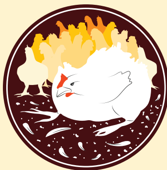
TRAPPED IN FILTH